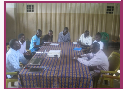
Human Resources held an Induction meeting for 7 new staff.